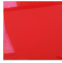
FG | (L03) Rouge