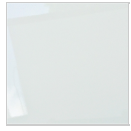
FG | (L01) Blanc

(FG) Product Fire Grade - Furniture Grade