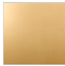
FG | (L09) Classic Gold