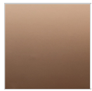
FG | (L08) Rose Gold