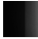
FG | (L06) Noir Vintage