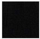
FG | (W03) Wenge