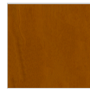
FG | (W01) Cerise